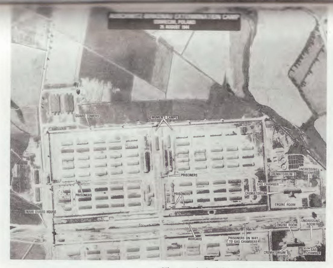
The Auschwitz-Birkenau Extermination Camp.