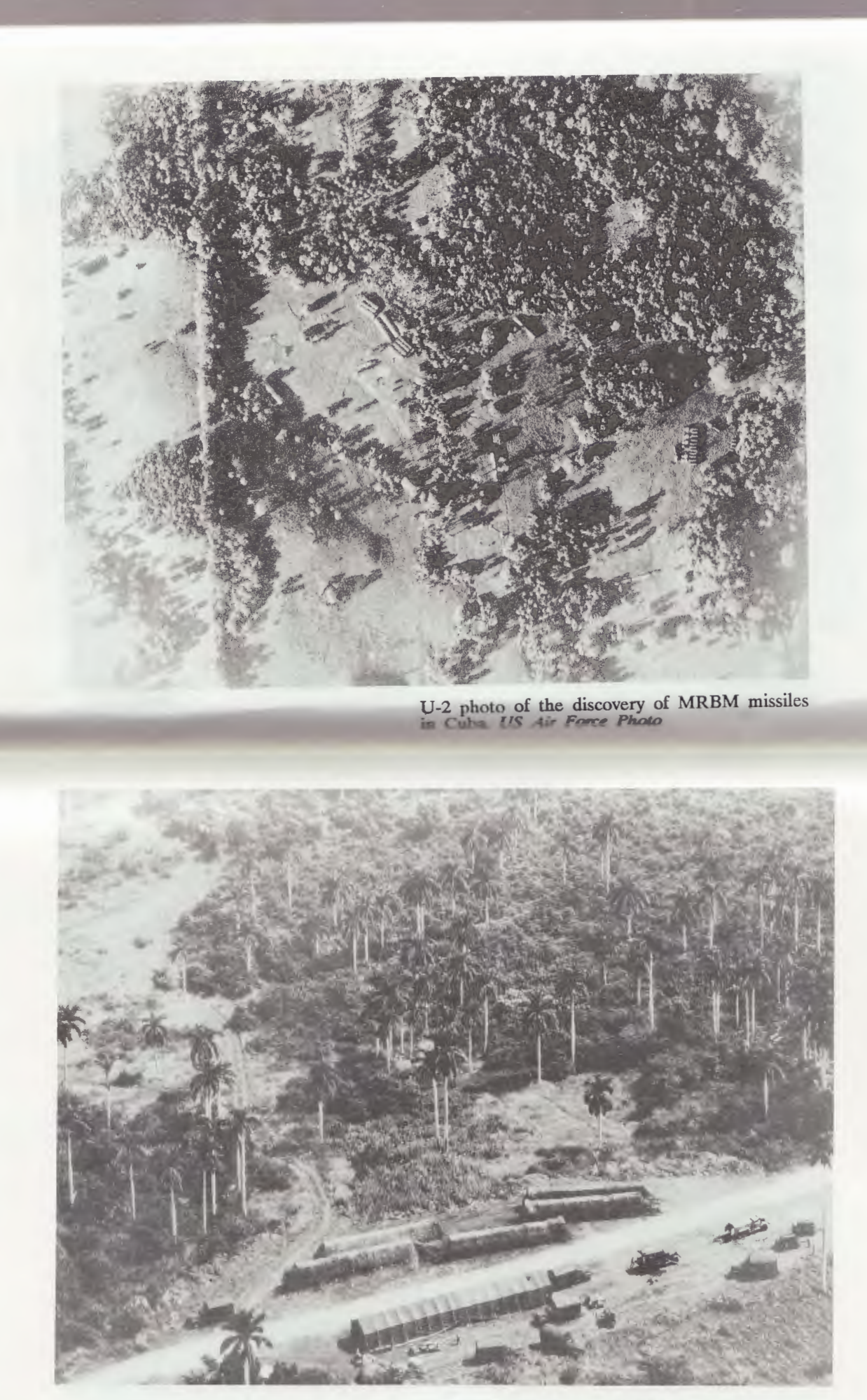
Low altitude photo of MRBM missiles in Cuba.