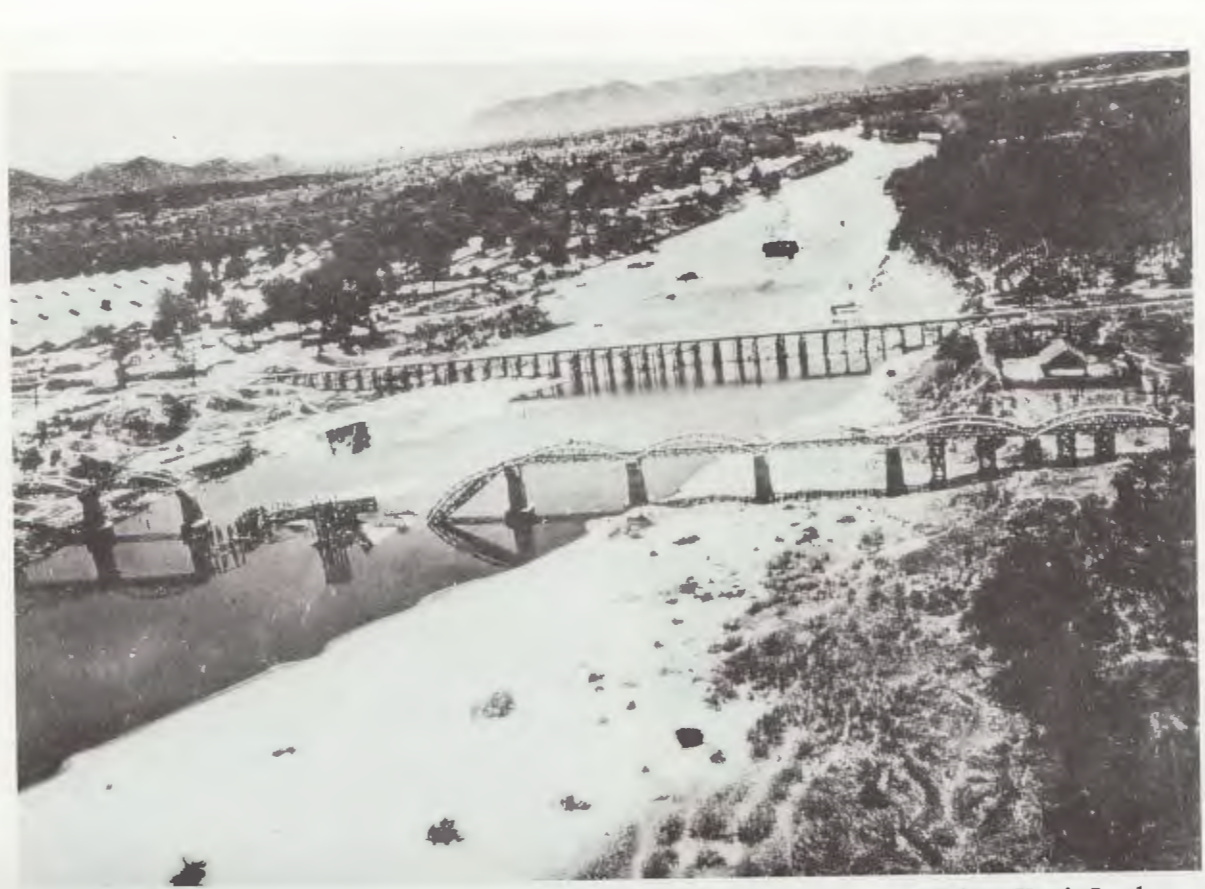
The Bridge Over the River Kwai. In the foreground the damaged railroad bridge. In the background the bridge the prisoners